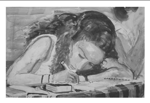
FIG. 1. A number of studies describing the application of acupuncture in inflammatory disease have been published. Conclusions are difficult to be made, due to different acupuncture techniques used and insufficiently described methodology. (Drawing by Theodoor van Baars.)

tive parameters (e.g. forced expiratory volume in one second (FEV<sub>1</sub>), oedema or secreted volume and surface temperature) better reflect the attributive effect of acupuncture in the recovery from inflammatory diseases, but do not distinguish between primary and secondary events. Therefore, documented research on underlying mechanisms indicating the specific release or inhibitory action on the formation of inflammatory mediators such as substance P, CGRP, \beta -endorphin and cytokines would undoubtedly indicate whether acupuncture is advisable as a complementary therapy and confirm preliminary results.